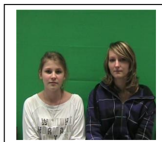
at the same time